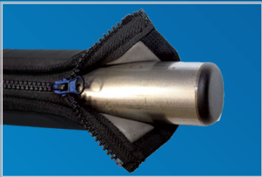
Installs and Zips Closed in Seconds