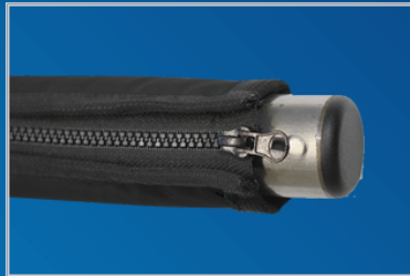
Fits Tight to Prevent Spin