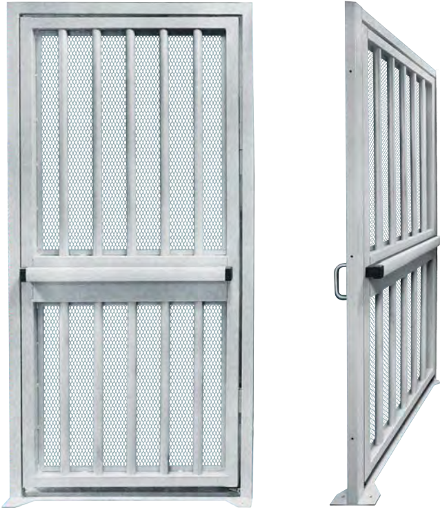
SwingGate HTG-M (Shown in Galvanized Finish)

Full Height Security • Matches SecureTurn Full Height Turnstiles • Reach Prevention