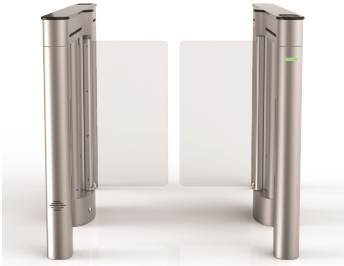
Control your EZ Lane SL2000 remotely from any device

The LaneAdmin Remote Monitoring Software is a browser-based software that allows you to take control of virtually all the day-to-day operational functions of our EZ Lane SL2000 optical turnstile. Whether you use a laptop, PC, or tablet, our LaneAdmin allows you to remotely control your SL2000 seamlessly.