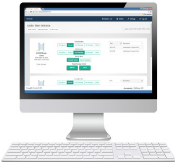
EZ Lane SL2000 LaneAdmin Software on a PC

Reports (Excel, CSV, PDF) are also easily extractable with LaneAdmin, allowing you to analyze turnstile activity like alarm conditions and traffic flows to get the best out of your turnstile access control system.