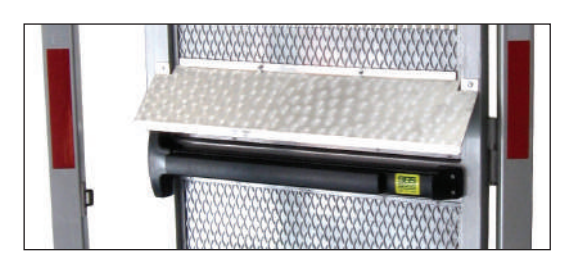
Push Bar – Push-bar shield for tamper resistance and weather protection.

Get in touch with us for expert advice, design assistance, project review, free quotes, and for help with your access control needs.