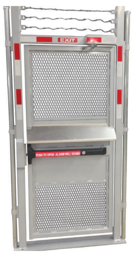
HTSG Shown in Galvanized Steel