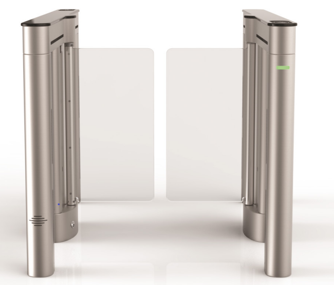
EZ Lane SL2000 (28" Standard opening up to 36" ADA opening)

The EZ Lane SL2000 sits comfortably at the crossroads of elegant refinement and technological superiority. This swinging barrier optical turnstile combines the security of a physical barrier turnstile with the sophistication of optical beam detection to prevent tailgating and unauthorized entry with ease. Keeping true to it's sleek design, the SL2000 also offers space for internal installation of proximity readers with the ability to mount larger readers externally if needed.