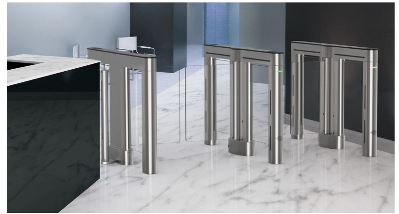
Modern design blends with any lobby (Cabinet Finish and Lid Color Options Available)

The SL2000's slim size and compact footprint saves floor space and allows use of optical turnstiles in areas where space is a premium.