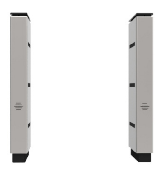
ClearPass CP3000 (28" Standard Opening with Optional 36" ADA Opening)