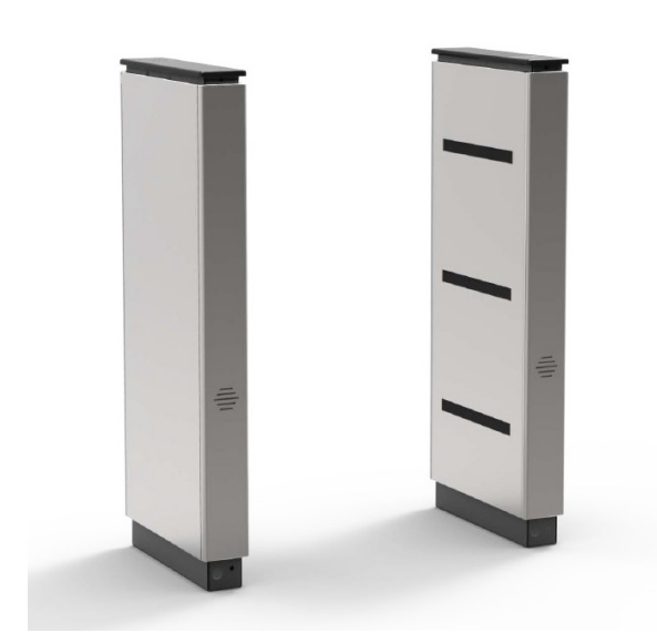
Narrow Profile Cabinets (Cabinets Just 4" Wide)