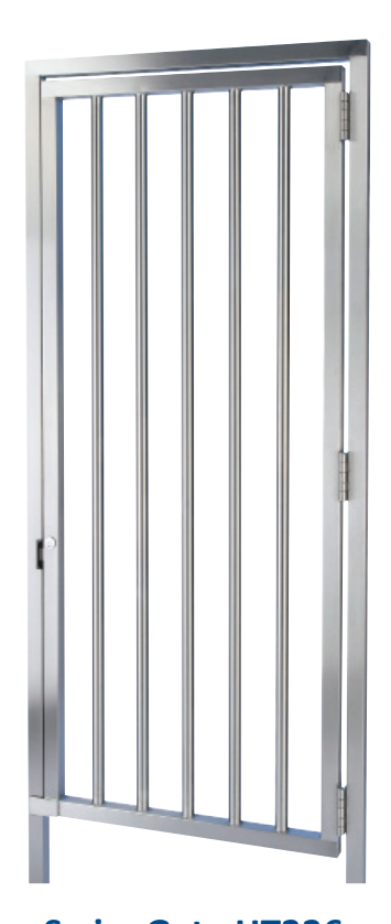
SwingGate HT336 with Bars Shown in Galvanized