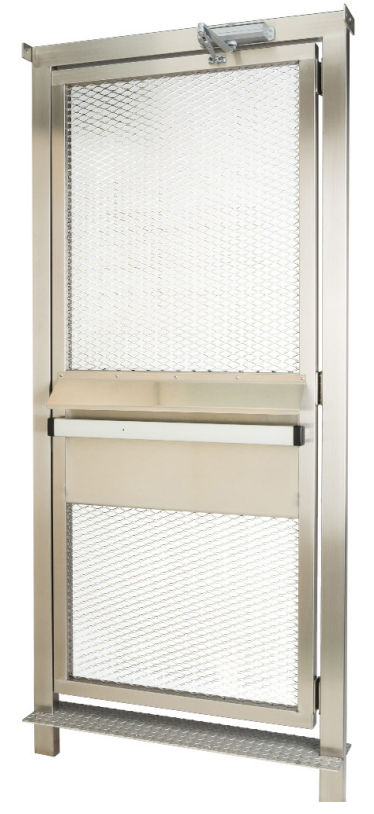
SwingGate HT336M with Mesh