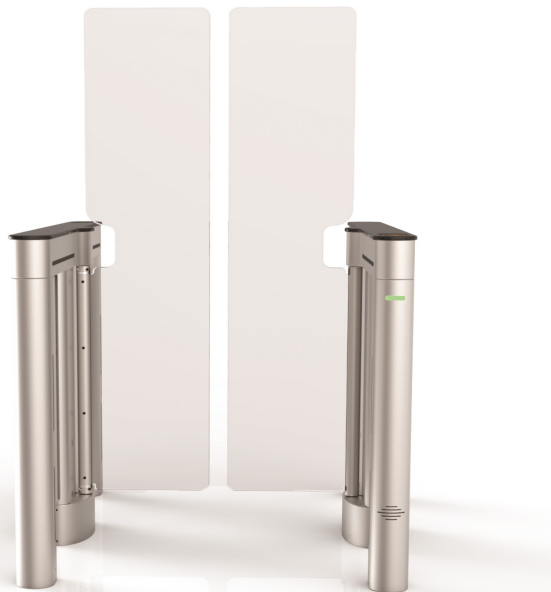
EZ Lane SL2000 High Barrier Option 69"

(35", 46", 69", & custom Heights Available)