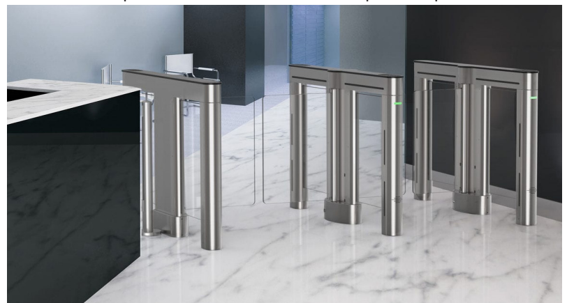
Modern design blends with any lobby (Cabinet Finish and Lid Color Options Available)

The SL2000's slim size and compact footprint saves floor space and allows use of optical turnstiles in areas where space is a premium.