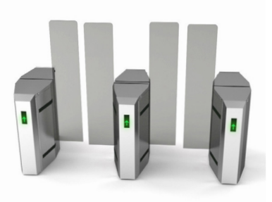
GT-1 Narrow Passage GT-2 Wide Passage (Also available in GT-3 ADA Passage)