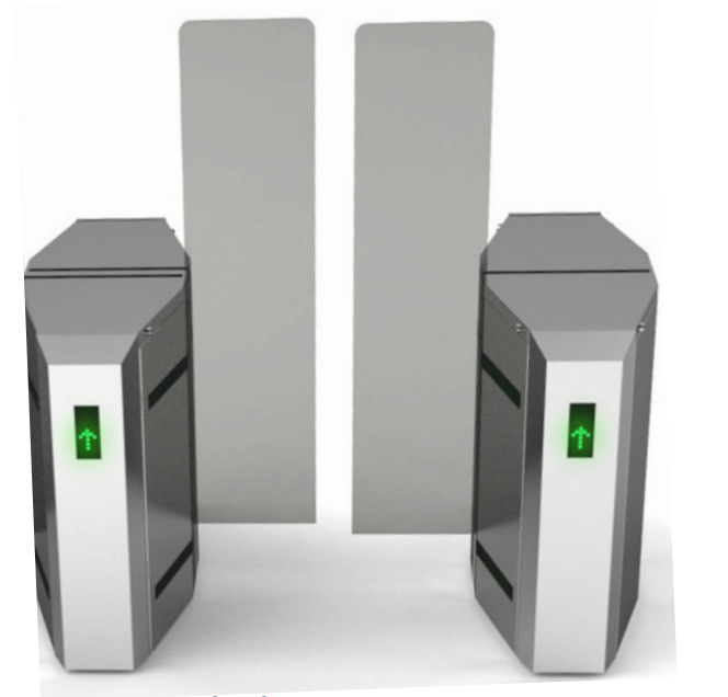
EZ Lane GT High Glass (22", 34" or 38" ADA opening)