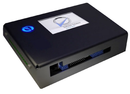
Internal LCD Touch Screen Display

Each GT Optical lane is equipped with an internal LCD touch screen interface that allows for easy configuration of Optical Turnstile functions and operating modes.