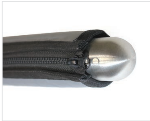
Fits tight and prevents spin.