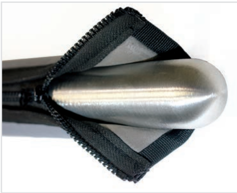
Installs and quickly zips closed in seconds.