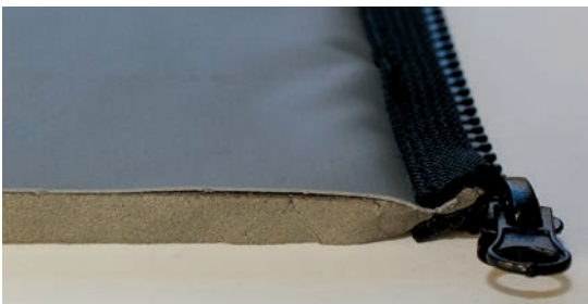
Note: Sleeve cut to show padded foam interior.