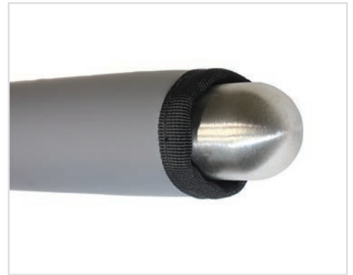
Soft-touch exterior pushes easily