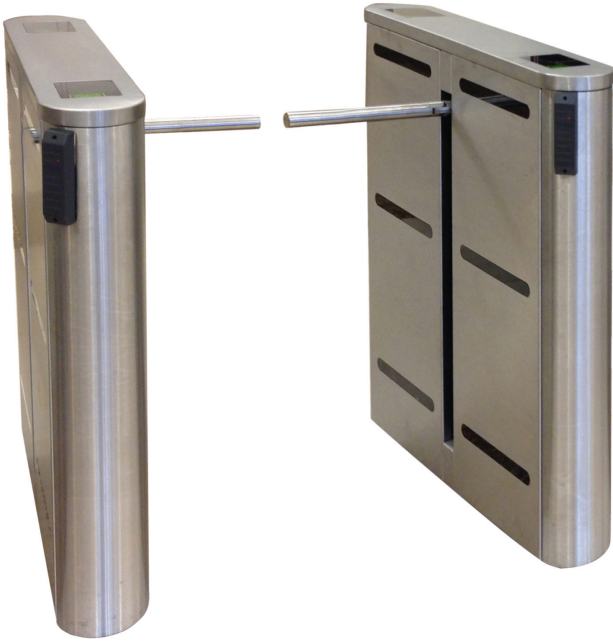
EZ Lane Drop Arm (22"-36" ADA lane widths)

Mid-Range Optical • Drop Arm Barrier • Bi-Directional • Card Stacking Tailgate Detection • Crawl Detection • Full Alerts