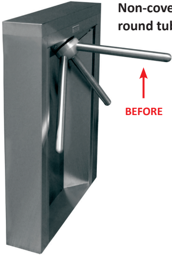
Non-covered bars are round tubular steel.