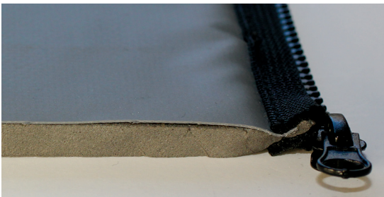
Note: Sleeve cut to show padded foam interior.