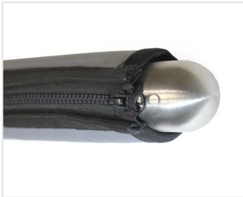
Fits tight and prevents spin.