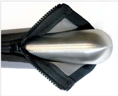
Installs and quickly zips closed in seconds.