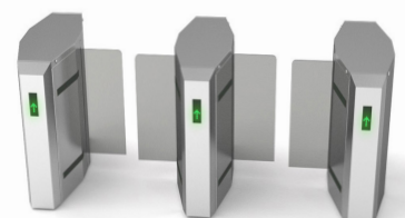
GT-2 Wide Passage