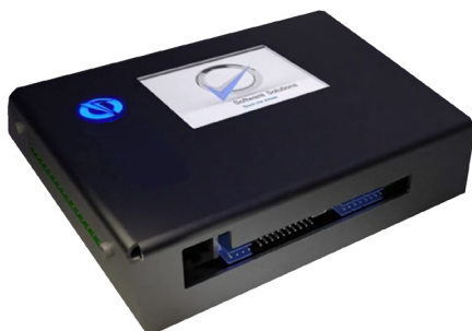
Internal LCD Touch Screen Display

Each GT Optical lane is equipped with an internal LCD touch screen interface that allows for easy configuration of Optical Turnstile functions and operating modes.