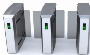
GT-1 Narrow Passage

Passage widths accommodate 22" and 34" clear passage as well as 38" clear ADA passage. Cabinets are built wider to house the larger glass needed for wide passage. Custom glass etching and assorted glass colors also available.