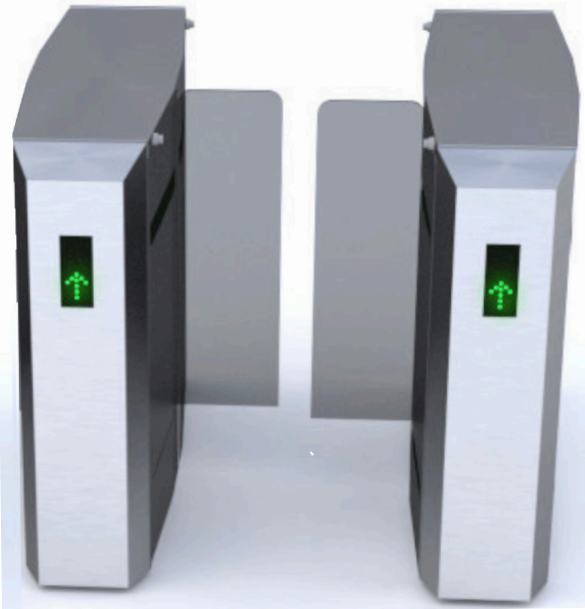
EZ Lane GT Low Glass (22", 34" or 38" ADA opening)

Mid-Range Optical • Enhanced Security • Retracting Glass Barrier • Bi-Directional Tailgate Detection • Crawl Detection • Full Alerts • Simple Programming