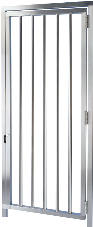
SwingGate HT336 with Bars

Shown in Galvanized (36" or 48" ADA opening)