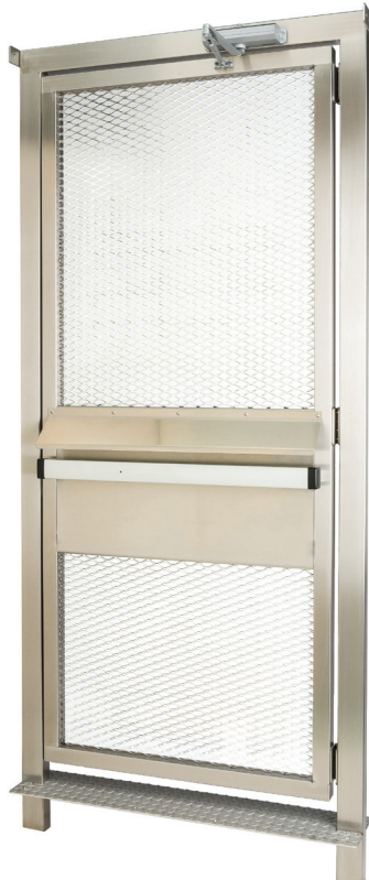
SwingGate HT336M with Mesh

Shown in Galvanized (36" or 48" ADA opening)