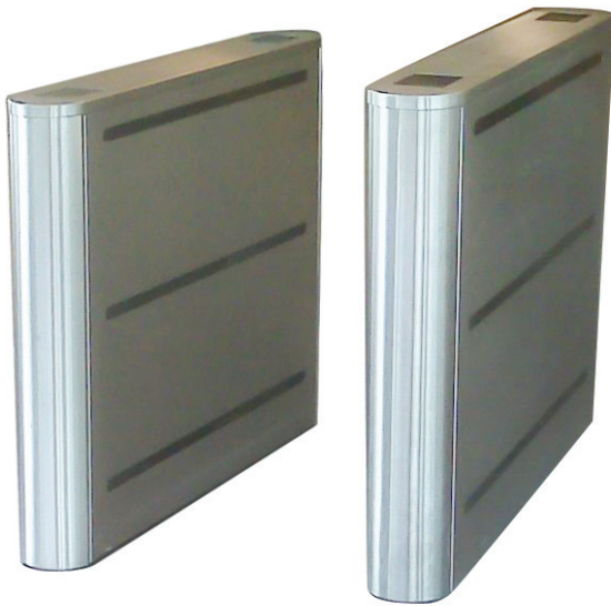
EZ Lane Standard (28"-36" ADA opening)

Mid-Range Optical • Open Lane Security • Bi-Directional • Full Size Cabinet Tailgate Detection • Crawl Detection • Full Alerts