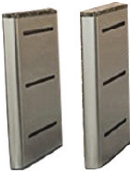
EZ Lane Slim (28"-36" ADA opening)

Entry-Level Basic Optical • Open Lane Security • Bi-Directional Space Saver Cabinet • Tailgate Detection • Crawl Detection • Full Alerts