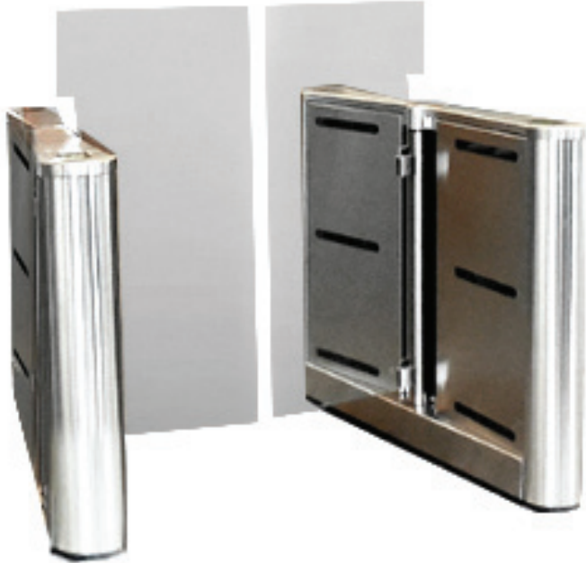
EZ Lane Hi-Swing Glass (28"-36" ADA opening)

Mid-Range Optical • Standard Security • Swing Glass Barrier • Bi-Directional Tailgate Detection • Crawl Detection • Full Alerts